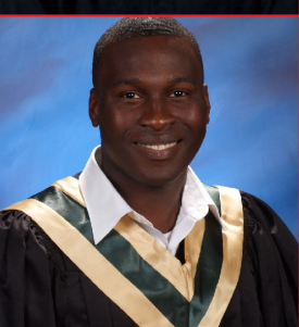
Prince Kassa Kouassi École secondaire publique Deslauriers